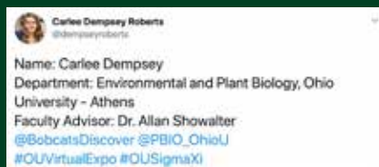
Carlee Dempsey '21 (Hughes)