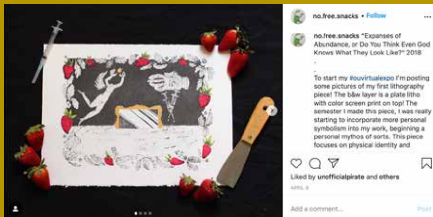
Moss Nash '21 (WR & AL Konneker)