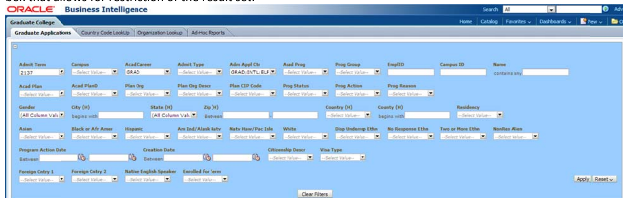
Figure 1 Graduate College Dashboard

The main dashboard allows individuals to query the complete list of all applicants in their program(s), to select the population of interest. Figure 1 shows the main dashboard interface. Each field contains a drop list or data entry box that allows for restriction of the result set.