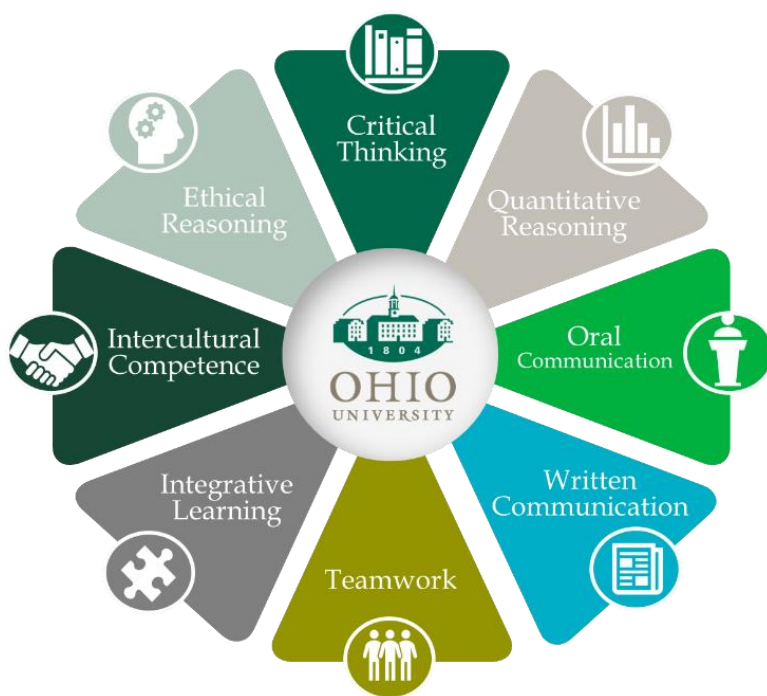
Figure 2: BRICKS Common Learning Goals

Additional details about common learning goals are provided in Appendix B .