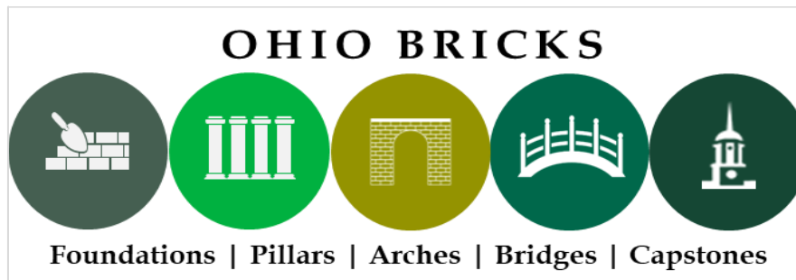
Figure 3: BRICKS Categories

The BRICKS program blends distribution and integration requirements while emphasizing a liberal arts education. It includes five categories.