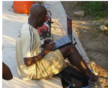
Two photos from Frednel. One shows a glimpse of the damage from the earthquake, another shows Frednel creatively using a generator to use his computer.