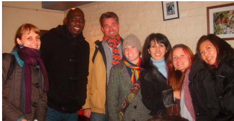
IDS students bundled up against the Southeastern Ohio winter.

International Development Studies Program Center for International Studies Yamada House Ohio University Athens, OH 45701