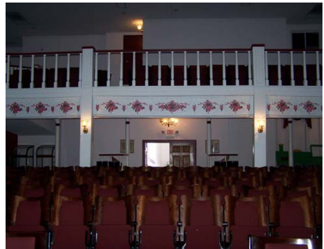
Stuart's Opera House inside - preserved as it was and managed by a local NGO.