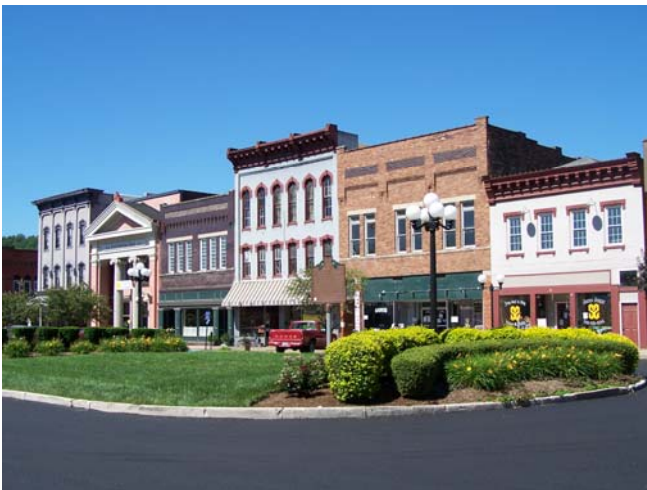
Nelsonville - a place in the heart, the historic square restored with community efforts.

For those IDS who did not do it, I encourage all of you people, to visit the nearest small town here – Nelsonville. Another community that will amaze every single visitor with the hidden treasures of art, nature, architecture and history. If you go over the weekend you can ride the old train and buy some nice pottery craft; Final Friday of every month, except the December is for those who are just art-passionate; the Opera house can attract the music lovers with country, jazz, rock, all good music. You will appreciate the community efforts to build Nelsonville as a valuable tourist destination.