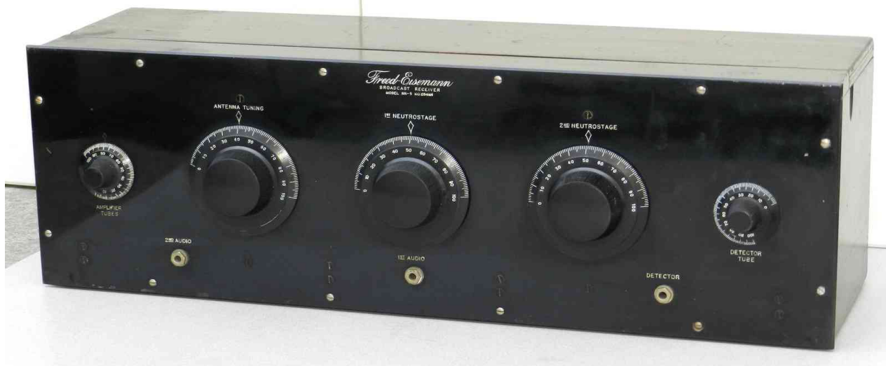
1923 Freed-Eisemann NR-5 (Neutrodyne with 5 tubes) Price - $150 in 1923 (equal to about $2650 in today's dollars) restoration by Rich Post