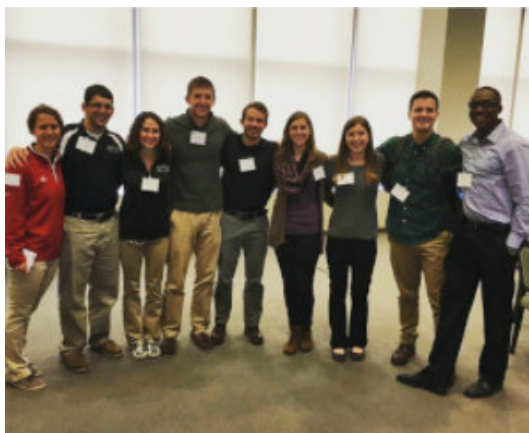
Several students from the Class of 2018 attended the Cleveland Clinic Sports Symposium November 3–5, 2016.

working on creating a new leadership structure with a chair, vice chair, and secretary position. Other topics discussed included the Alumni Reception at CSM, having an alumni gathering at the OPTA Conference in March, and inviting board members to the annual graduation dinner to welcome graduates to the alumni community. Please contact us by email if you are interested in learning more or becoming a part of the Alumni Board.