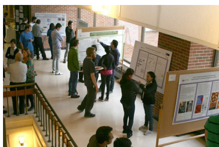
Students showcase their research in Clippinger.

NQPI, along with the Condensed Matter and Surface Science (CMSS) Program sponsored their bi-annual poster session on November 19, 2015.