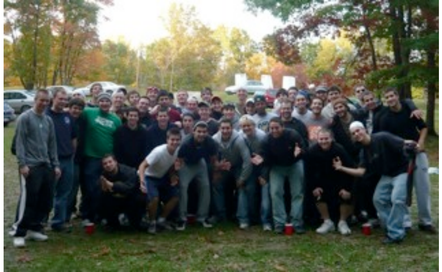
Brothers and pledges enjoy a beautiful Saturday afternoon at Smoke Rise camp site.

If you can sense exuberance flowing from the brothers of AEPi—it's because they are chock full of it. The brothers of AEPi are very proud to announce their successful Fall rush. Epsilon Deuteron, the newly initiated pledge class, is comprised of 27 eager new members. Freshly initiated, our sights are set high for this group. They enter our ranks with a plethora of leaders who will, together, help to strengthen our brotherhood even further.