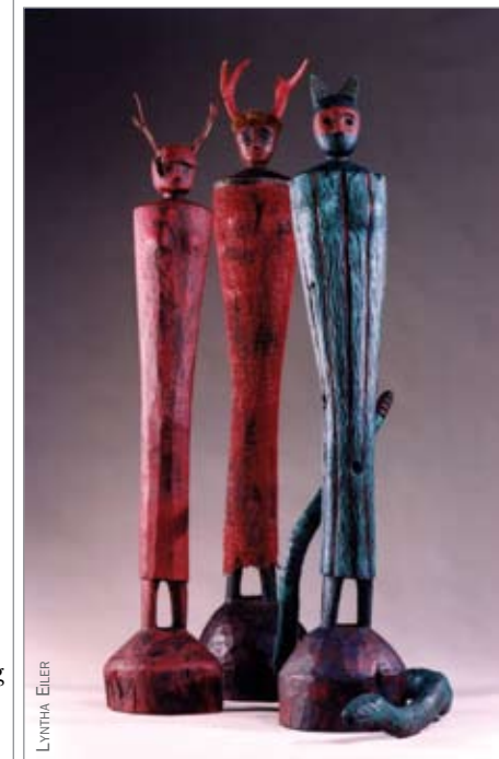
The Anasazi Goddesses, all painted woods, have been widely exhibited.