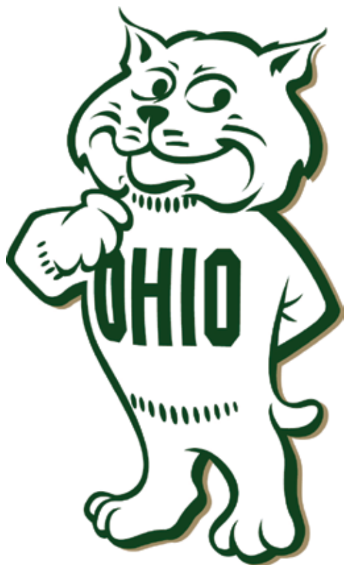
This version of the Bobcat looks familiar to alumni of the 1960s and '70s.

Heritage Line brings back fond memories — but for a limited time only