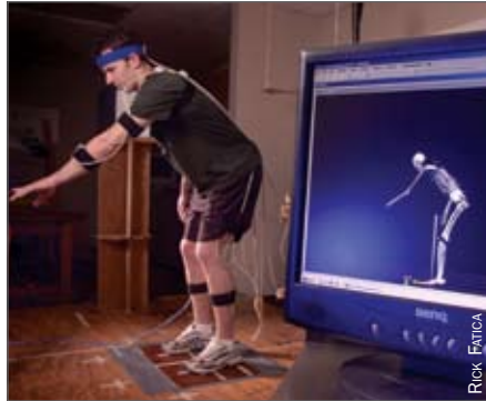
A volunteer models one of the reaching tasks used in the back pain study, and the computer screen shows the skeleton image that results.

The study confirmed what researchers have long suspected: People with a high fear of back pain will twist, bend and make other unusual moves to try to avoid more aches. It might be OK to baby sore muscles for a while, but protecting them for too long can cause them to weaken. When those muscles are called into play unexpectedly — such as when lurching forward to grab a falling bag of groceries — more