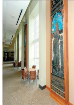
Graduate Student Senate teamed with Graduate Studies for the fair at Walter Hall, pictured here.

President. He added, "if the applicant pool to OU graduate programs increases, we have the opportunity to admit more diverse and qualified students, which could improve graduate programs overall."