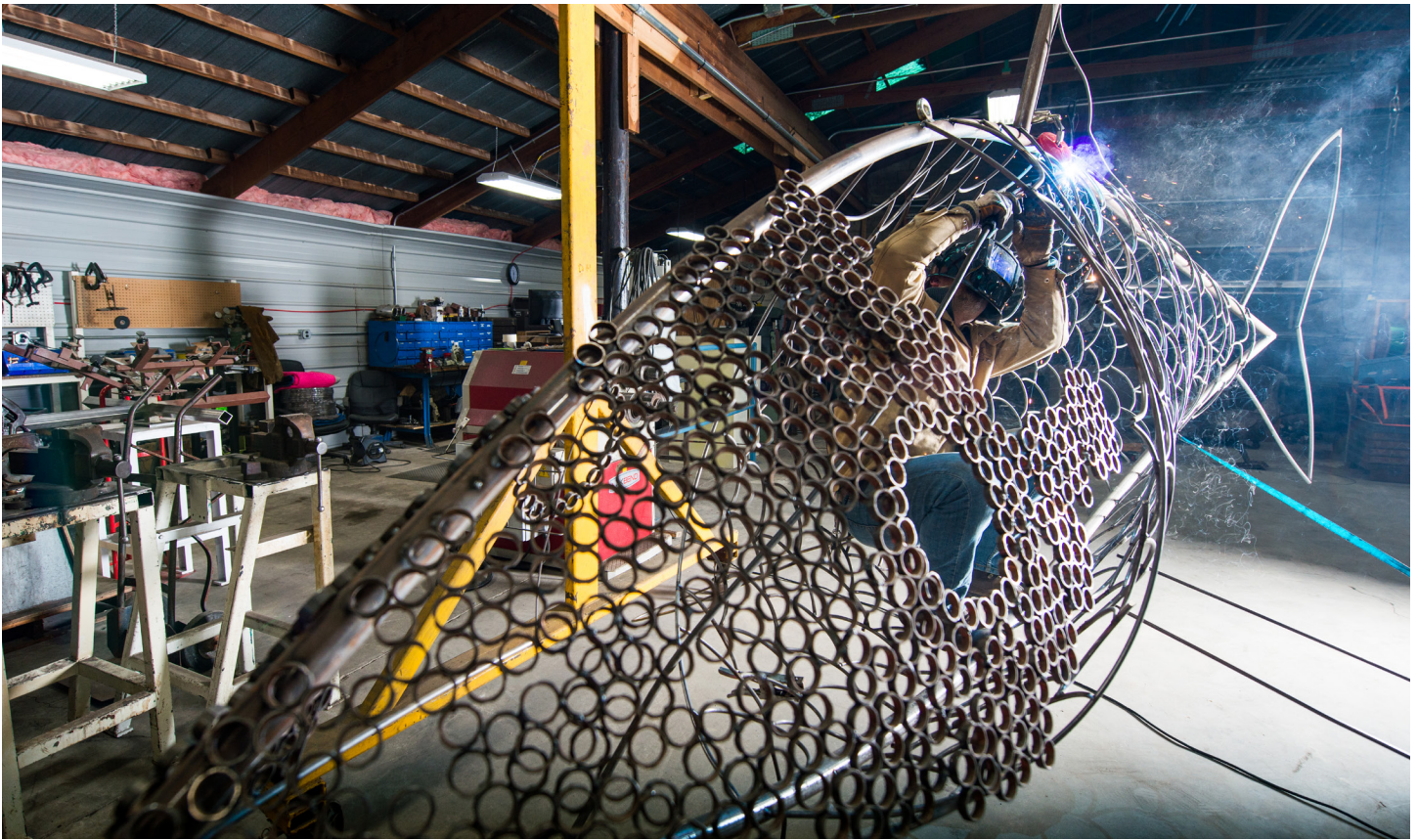
The LIGHTS program has provided strategic planning support to DG Welding and Design in Malta, Ohio, and other regional businesses.

The LIGHTS Regional Innovation Network , led by Shawnee State University in partnership with the Voinovich School of Leadership and Public Affairs, the OHIO Innovation Center, and Ohio University-Southern, provides expertise, training, and resources to the workforce, entrepreneurs, companies, and local communities in a 28-county region of Ohio, West Virginia, and Kentucky.