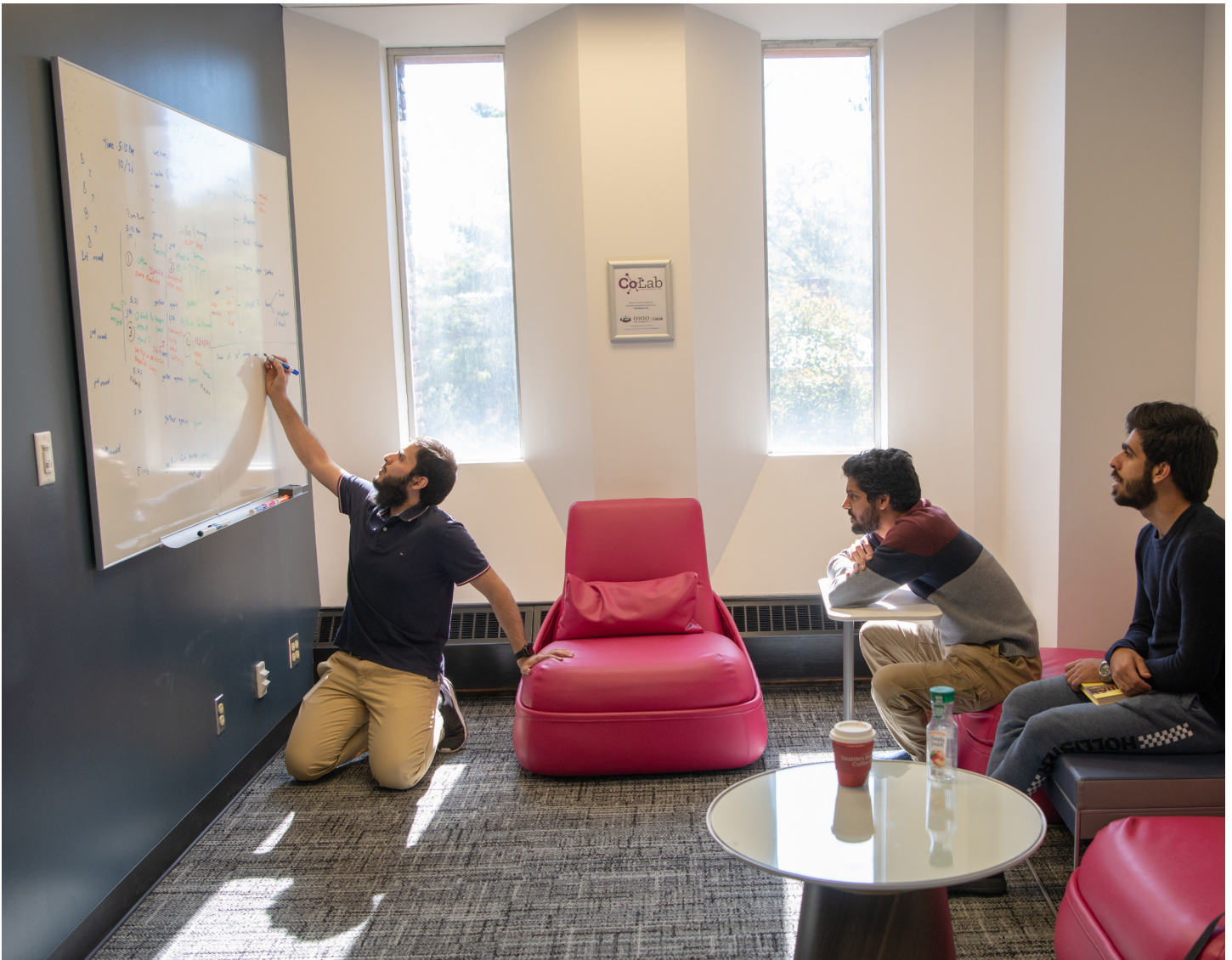
Ohio University students from across campus can use the CoLab, which offers central space and programming for student entrepreneurs and innovators.

The new Bobcat Seed Fund helps students pay for certain goods and services associated with starting a new business, such as legal and accounting services, software development, and prototype creation. The fund also supports a mentor and partner network for student and local entrepreneurs. In addition, the center works with faculty members from colleges across campus to create a network of “entrepreneurial champions” who incorporate entrepreneurship and innovation into existing or new courses.