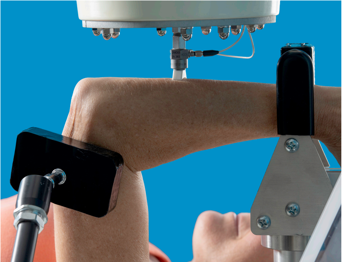
AEIOU Scientific LLC, a client company of TechGROWTH Ohio and the Innovation Center, is offering the Cortical Bone Mechanics Technology™ for sale as a scientific research product.

AEIOU Scientific: Ohio University licensed a technology that can accurately estimate bone strength to Ohio startup company AEIOU Scientific LLC. The company began offering the Cortical Bone Mechanics Technology™ for sale as a scientific research product during fall 2018. Faculty members involved in the development of the technology participated in the I-Corps@OHIO program, and the company is using a National Institutes of Health Small Business Innovation Research grant to further commercialize the technology. AEIOU Scientific is a client company of TechGROWTH Ohio and the Innovation Center, which provide business services, office space, and venture development assistance.