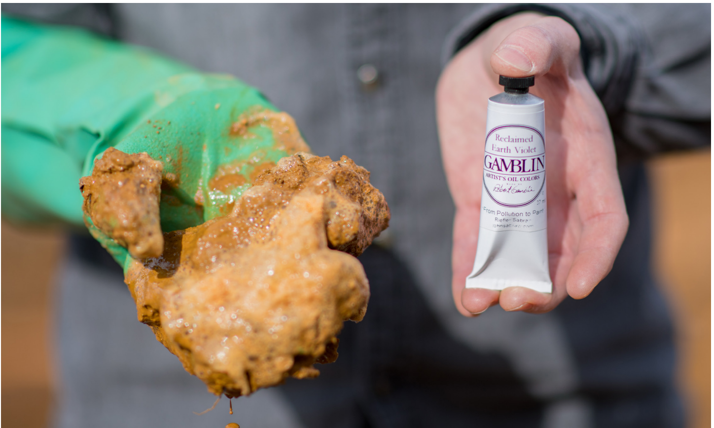
The Technology Transfer Office has worked with faculty researchers to commercialize a process that turns pollution from Ohio streams into paint that can be used by artists.

Ohio University and The Ohio State University co-hosted a conference on fostering university-industry partnerships in September 2019. The event was the annual fall international meeting of the University Industry Demonstration Partnership (UIDP), a project-based organization focused on exploring issues that impact university-industry relations as well as developing innovative approaches to working together. The conference's focus was on workforce development and talent management, and featured guest speakers from across Ohio University.