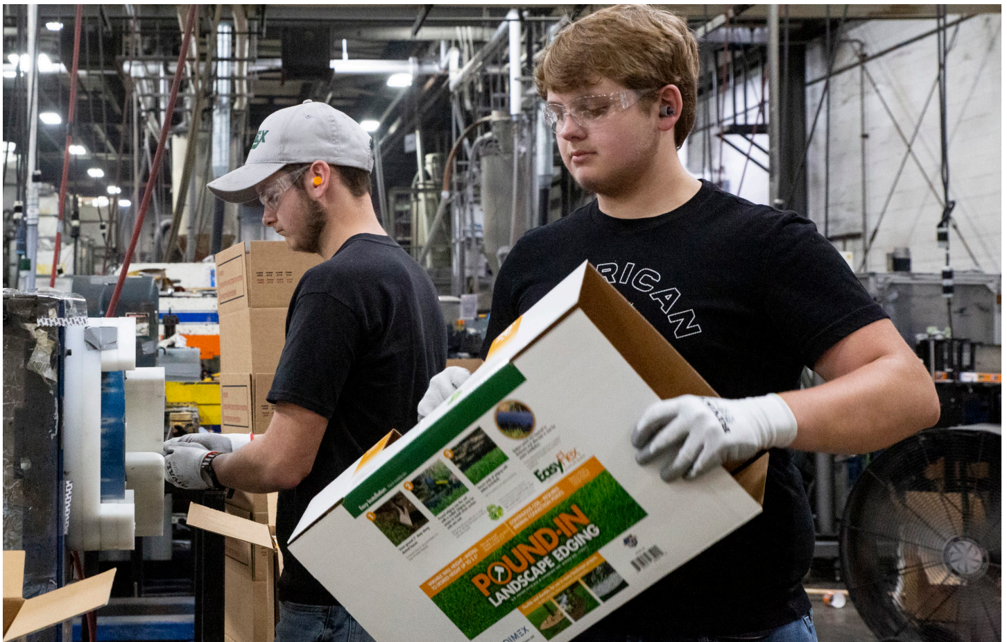
The SEE and LIGHTS programs have supported the Building Bridges to Careers program, which provides youth career development opportunities in Marietta, Ohio.

Initially funded as a pilot program by the Appalachian Regional Commission's POWER initiative, SEE has received two grants totaling $1.05 million . Since its May 2017 launch, SEE has assisted 95 startups and small enterprises that address the most important social challenges facing Appalachia. Program participants have already created more than 80 jobs and enabled clients to achieve more than $10 million in resources .