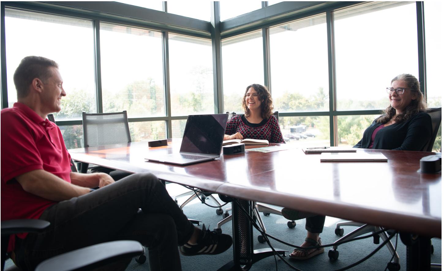
The Innovation Center provides a full-time executive coach for its clients and business consulting to regional entrepreneurs.