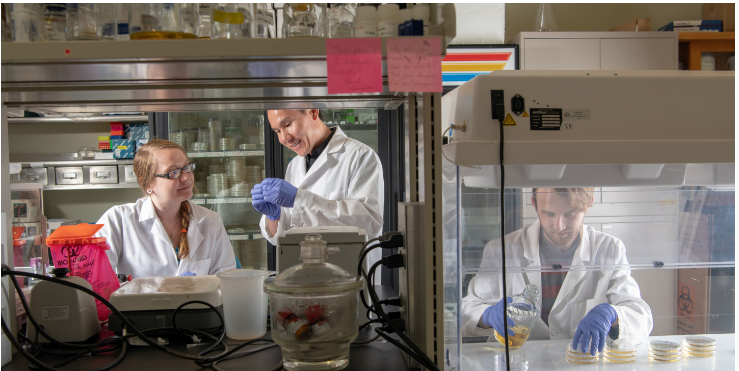
The Innovation Center features labs and offices for biotechnology startup companies to grow in southeastern Ohio.

In 2019, InBIA, the leading international professional association for entrepreneurial support organizations, honored the Innovation Center with the Randall M. Whaley Incubator of the Year Award and named it the Rural-Based Entrepreneurship Center of the Year . In 2018, the Innovation Center supported 297 jobs that generated an estimated $12.9 million in employee compensation in Athens County and an estimated $2.1 million in state and local tax revenues . Since 2014, the business incubator's job creation numbers have increased 112 percent , employee compensation generated from its client companies has increased 111 percent , and tax revenue has increased 222 percent . These figures represent the number of jobs created directly, indirectly, or induced by supported businesses. Since 2015, the Innovation Center has won more than $3.4 million in grants to support its work.