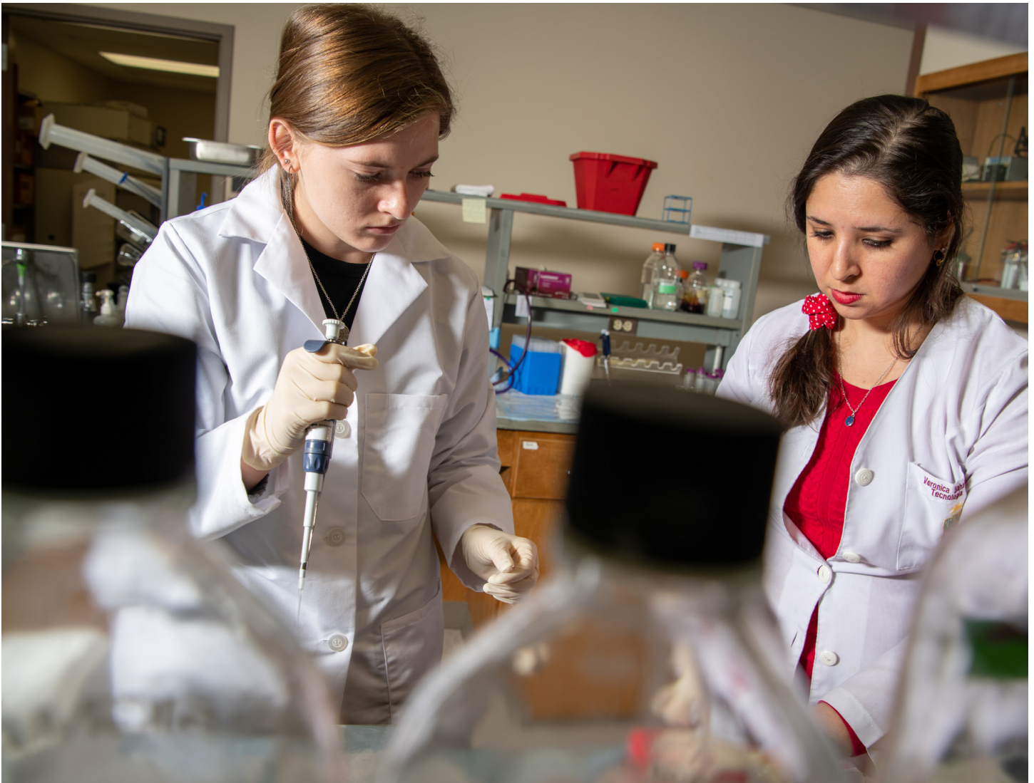
Scientists at the Edison Biotechnology Institute pursue basic and applied research at the Konneker Research Center.

The Edison Biotechnology Institute pursues basic and applied research on health and medical disorders, with a focus on developing innovations that can benefit society through the creation of technologies and companies. A principal investigator with 25 years of pharmaceutical industrial experience also provides business coaching for pharmaceutical and medical device startups.