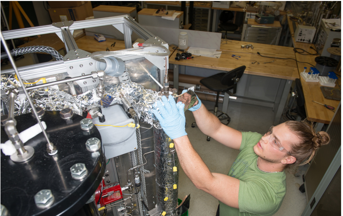
Researchers in Ohio University's Russ College of Engineering and Technology are developing new technologies for use in the energy industry.