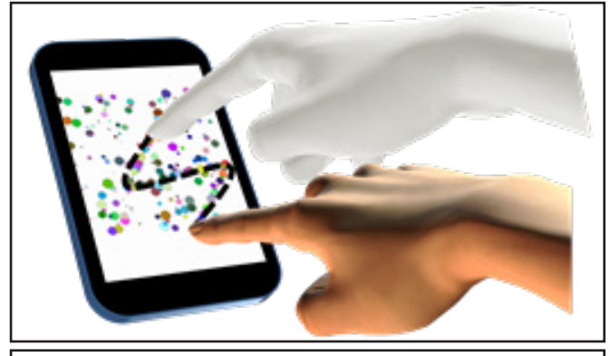
Fig. 3: Gesture-based response to the dynamic CAPTCHA.

The answer is simple. Even the largest and most complex computing system in the world, IBM's WATSON, failed to complete two tasks while playing Jeopardy! First, WATSON did not field any video clues. Second, WATSON was not able to physically push a button to buzz in for an answer. Our CAPTCHA system requires: 1) the ability to decode an image within a video; and 2) generation of a physical response through a gesture.