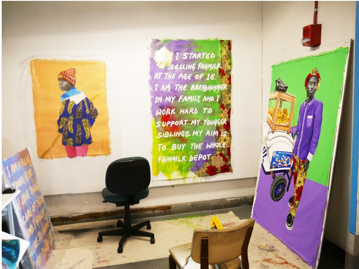
Figure 7. My studio space showcases preparatory works I have made in order to plan and propose my MFA thesis exhibition. They are street people with their stories painted next to them.