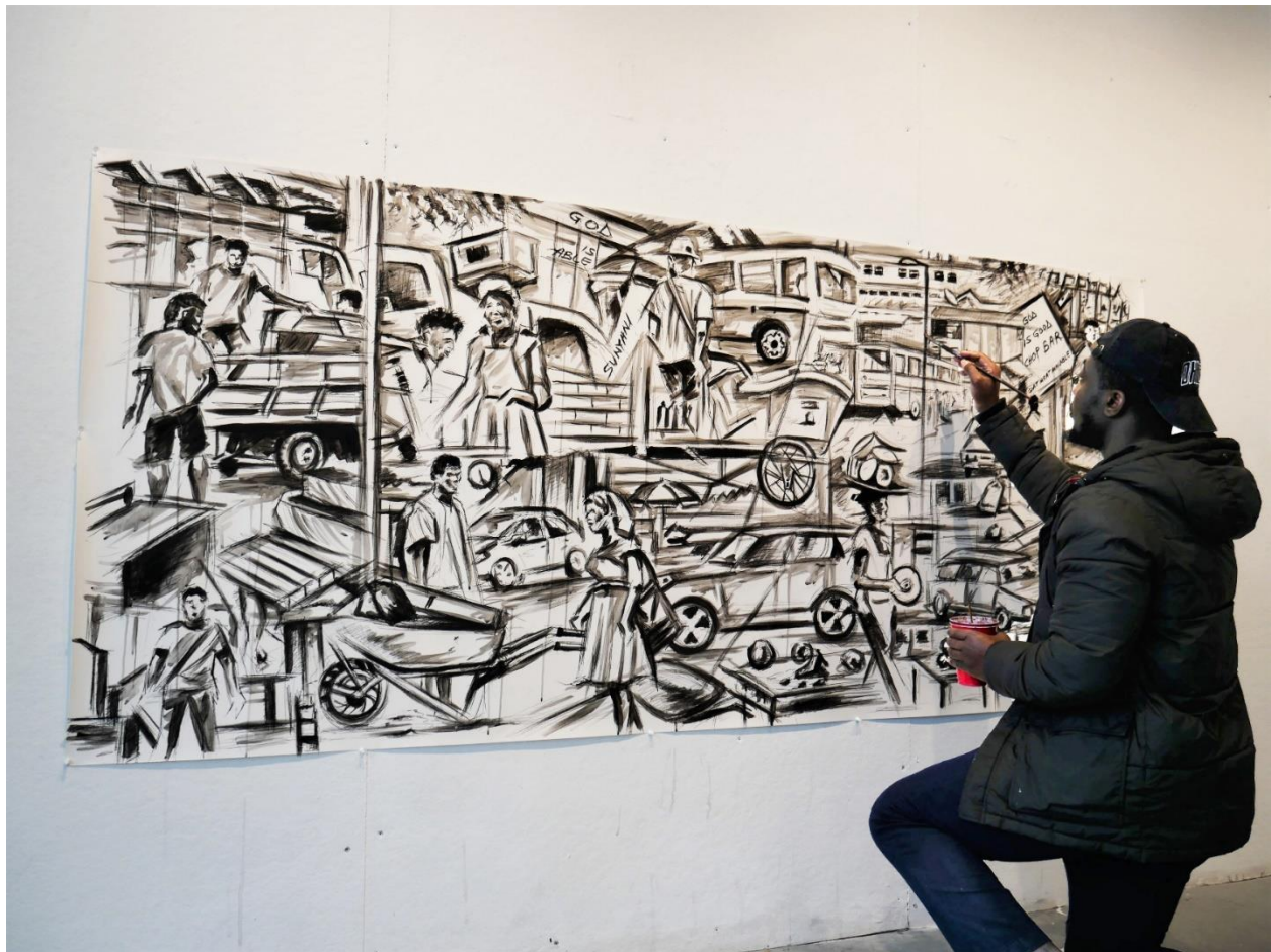
Figure 3. Photo of me drawing a composition of a street scene in Ghana. It shows spaces in Ghana where street people engage in their activities, such as bus stations, and the movement of global goods with which people living on the streets engage.

I have included images of my previous work referred to in the project narrative as phase one for my thesis exhibition. I created the paintings with lightfast acrylic paint, charcoal, gold leaf, and Ankara fabric on paper and canvas.