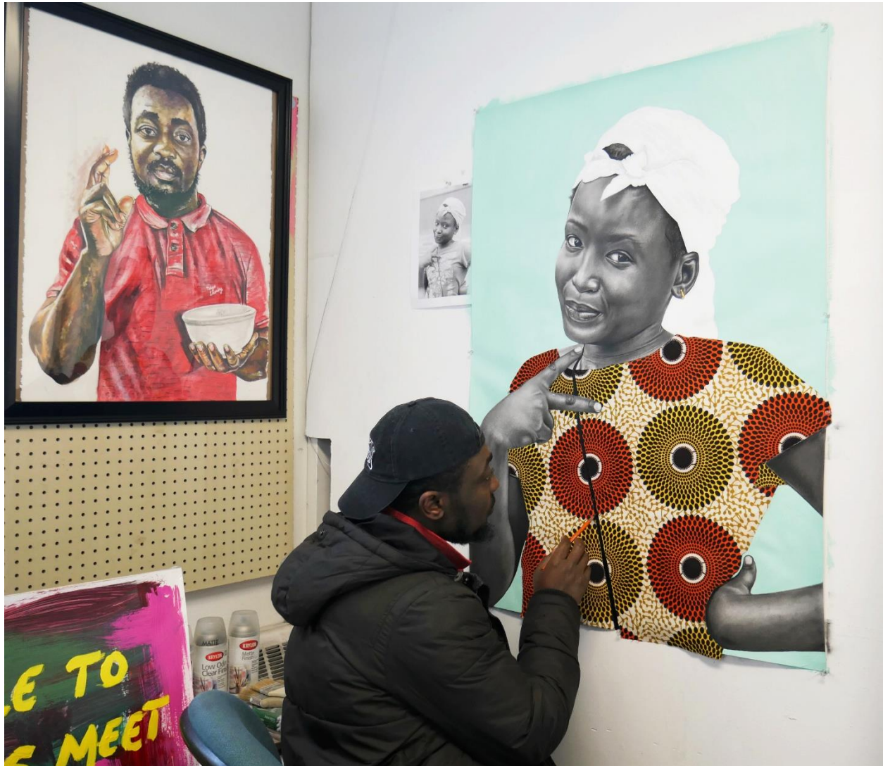
Figure 6. Photo of me drawing a street girl from Ghana titled Young girl with white headdress wearing Ankara fabric .