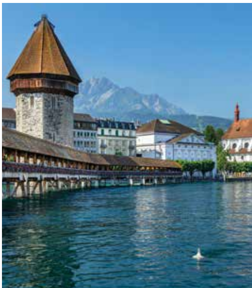
Lucerne’s beloved Kapellbrücke (Chapel Bridge)