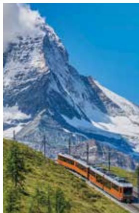
The Gornergratbahn open-air railway

Day 12: Salzburg Our walking tour this morning features the the 17 th -century Mirabell Gardens; the Baroque Old Town, now a UNESCO site; and visits to Salzburg Cathedral and medieval Hohensalzburg Fortress, one of Europe’s largest and best-preserved castles. This afternoon and evening are free for further exploration and lunch and dinner on our own. We have the opportunity to be in the city during the celebrated Salzburg Festival showcasing classical music and performing arts (no formal activities planned). B